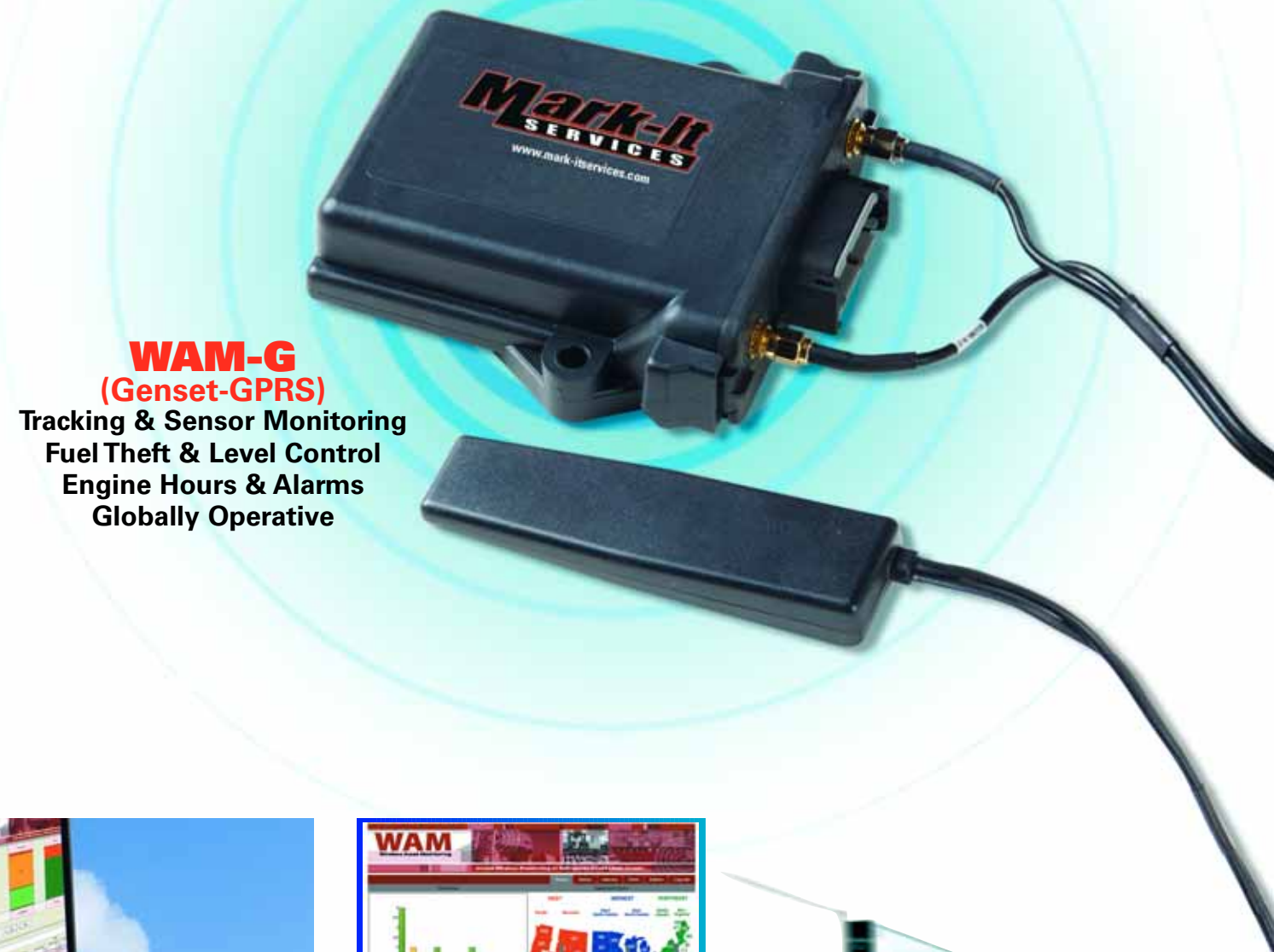
WAM-G (Genset-GPRS) Tracking & Sensor Monitoring Fuel Theft & Level Control Engine Hours & Alarms Globally Operative